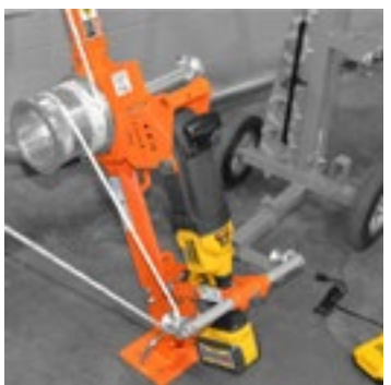
Built-in Rope Engagement Capstan Switch