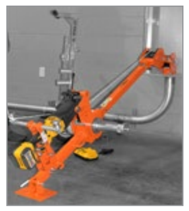
Fully Self Contained Unit FASTER SAFER WORKSPACE