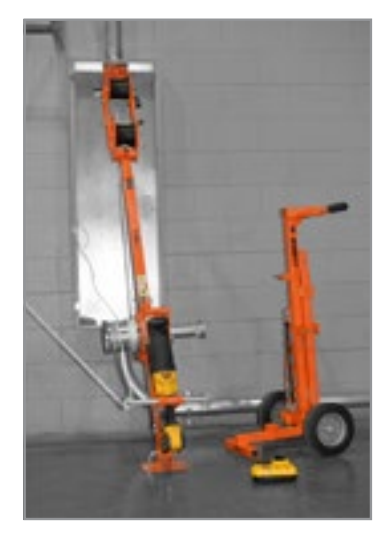
Handles Overhead, Underground, or Side Pulls with Ease.